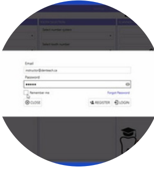
Log in, select rubric & resolution