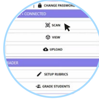
Start scanning and setting