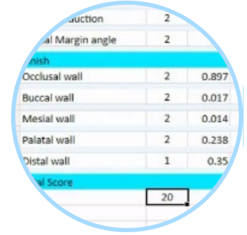
Grade, statistics and report