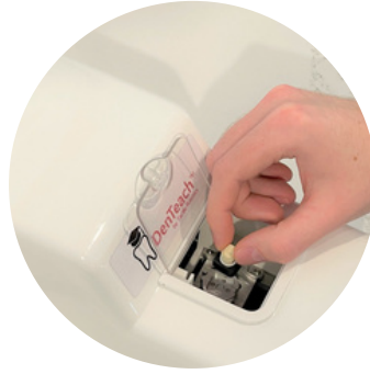
Insert tooth to scan